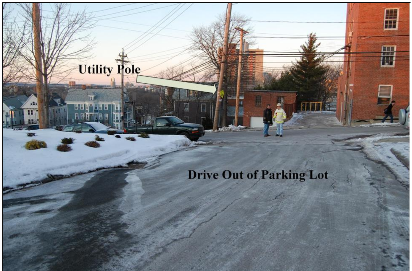
Photo 4. Shows the left hand turn the chauffeur had to make when exiting the parking lot. Photo taken on the day of the incident following the incident.

When preparing to leave the medical call, the chauffeur placed the ladder truck in “drive” and released the parking brake. The chauffeur pulled forward and turned left out of the parking lot, immediately stopped, and then backed up to reposition the ladder truck so that the ladder did not strike a utility pole (see Photo 4). He pulled forward again and carefully negotiated the ladder truck away from the utility pole.