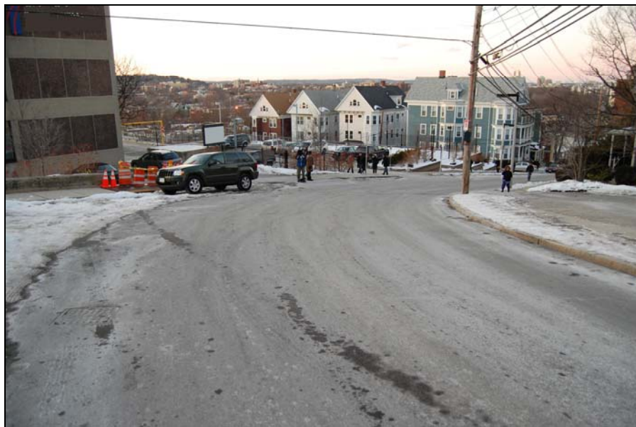
Photo 5. Right downward curve negotiated by ladder truck chauffeur.

After this maneuver, the chauffeur had to immediately negotiate the aerial ladder through a right hand, downward curve (see Photo 5). Once the ladder truck was straight and descending the hill, the chauffeur applied pressure with his foot to the brake pedal and had no response. The brake pedal went to the floor without resistance. He quickly began pressing the brake pedal in an attempt to get the brakes to actuate as he advised the victim that he had “no resistance or pressure” when applying his foot on the brake pedal.