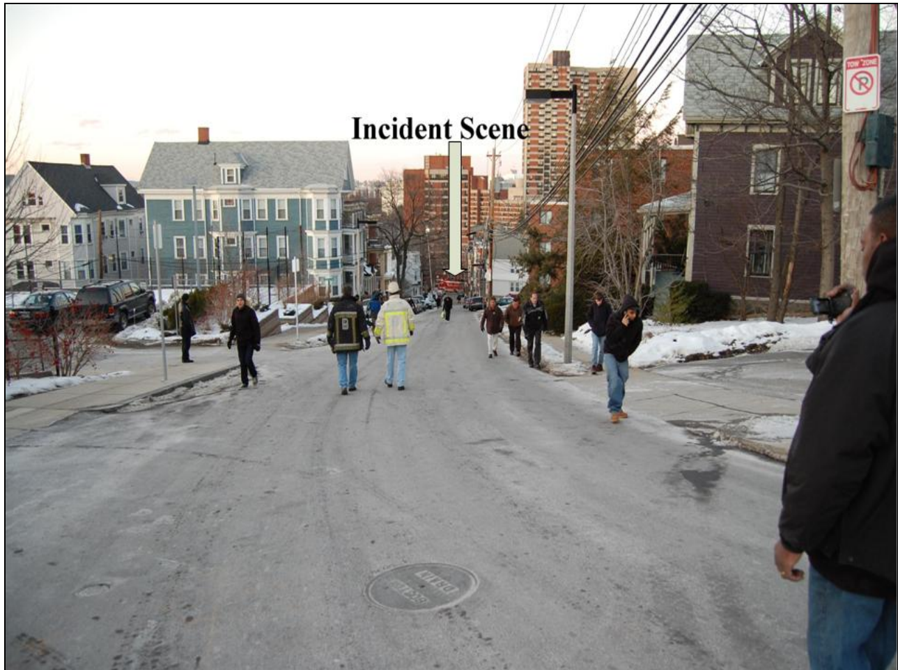
Photo 2. View from atop the hill after the incident.