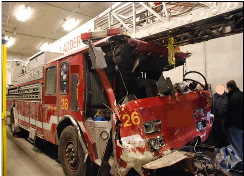
Photo 1. Aerial ladder truck following the incident.

The incident involved a ladder truck with two firefighters, Lieutenant (victim), and a chauffeur. The apparatus involved in this incident was a 1995, 110-ft rear-mounted aerial ladder truck with a diesel engine, automatic transmission, and anti-lock and air brake systems (see Photo 1). Based on the department's aerial ladder specifications sheet 6 for that year, the engine was a 736 cubic inch turbocharged two-cycle diesel engine. The automatic 4-speed transmission was specified to have an integral output retarder using a hydrodynamic braking system capable of being activated through normal application of the air brake treadle valve utilizing a step apply system to activate it, and a foot control valve supplied to provide modulated application to the retarder system. The specifications also included installation of a retarder enable switch to activate the retarder system with separate indicator lights mounted in the cab that would indicate activation of the retarder and retarder overheating. The air brake system was specified to have separate brake chambers for each wheel, a dual treadle valve splitting the braking power between the front and rear systems, an air dryer with an additional 1,738 cubic inch reservoir added to the air system to serve as a wet tank and a quick build-up for sufficient volume of air to comply with Federal Motor Vehicle Safety Standard 121 (FMVSS 121), a and spring actuated emergency/parking brakes installed on the rear axle.