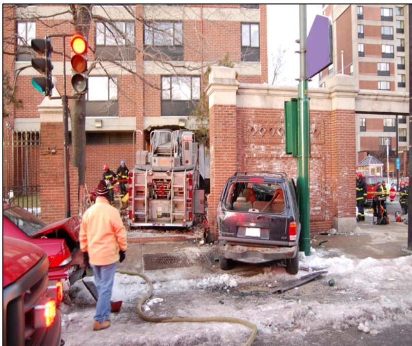
Incident scene.

On January 9, 2009, a 52-year-old male career Lieutenant (the victim) died and three male career fire fighters were injured, when the ladder truck they were riding in failed to stop while traveling down a hill. The ladder crew had just cleared from a medical assist call prior to the incident. The chauffeur turned left out of a parking lot and immediately had to stop and back up to allow the aerial ladder overhanging the cab enough clearance to pass a utility pole on the street. After clearing the pole, the chauffeur immediately negotiated a right downward curve. He then applied the brake pedal and had no response. The chauffeur told the victim he had “no brakes” as the ladder truck gained speed descending the hill. The chauffeur tried placing the ladder truck in neutral and applying the parking (maxi) brake to slow the apparatus down, but there was no response. The chauffeur was able to navigate the ladder truck through a busy intersection, crashing through two parked cars and a brick wall, before coming to rest within a multi-story residential complex.