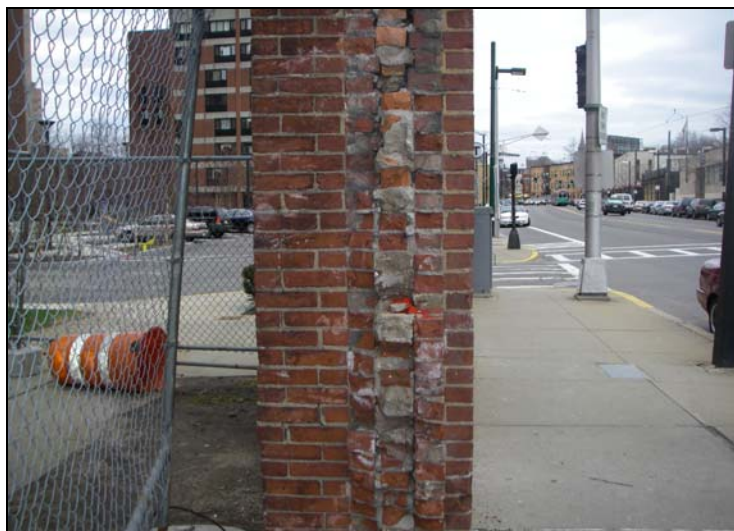
Photos 6 and 7. Photo at top shows damage received to parked cars and exterior view of brick wall. Photo at bottom shows the thickness of the wall that the apparatus went through.