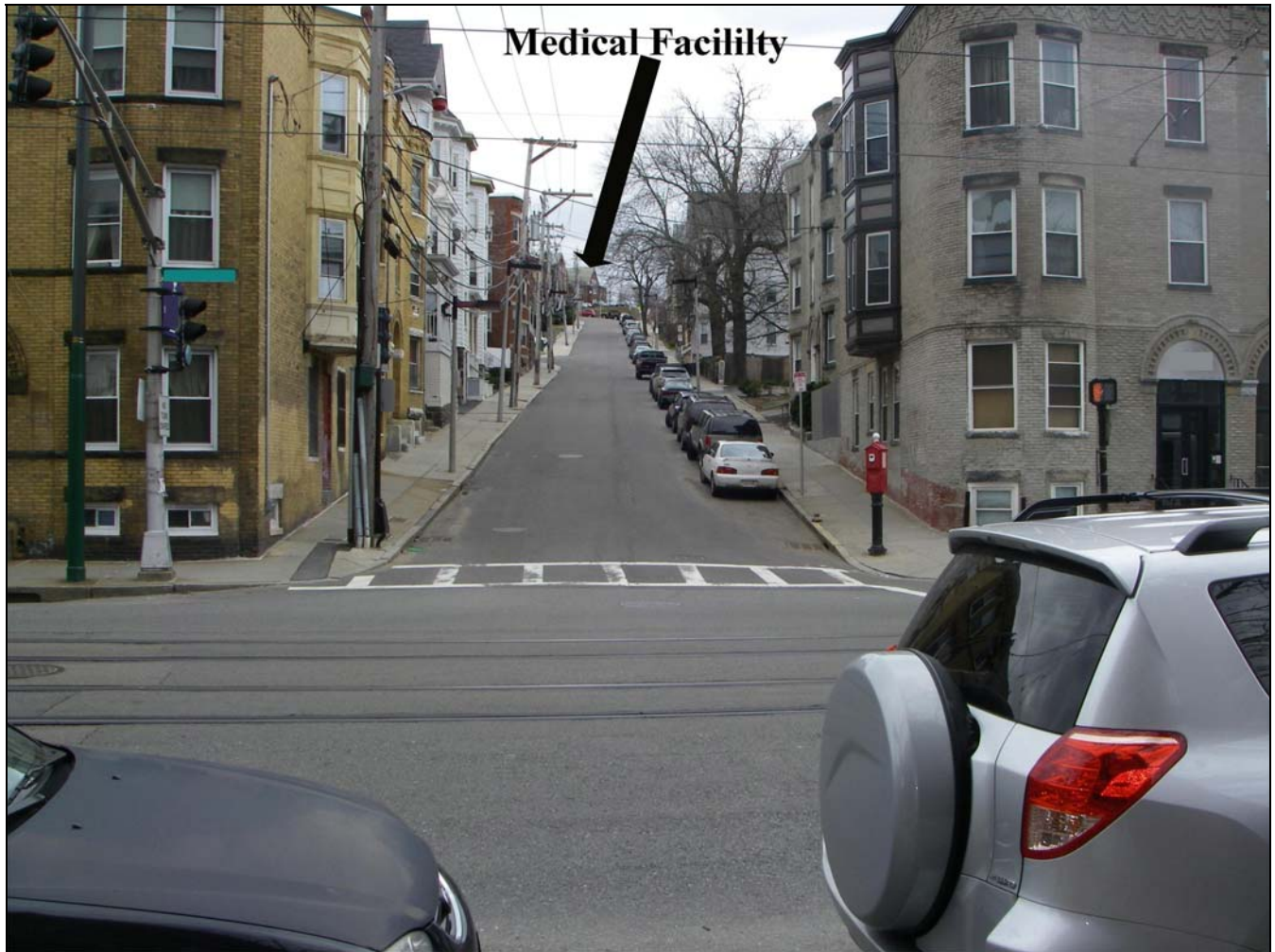
Photo 3. View from the bottom of the hill; taken after the fatal incident.

At the top of the hill, the chauffeur turned right into a medical facility’s parking lot (the location of the medical assist call) and drove straight to the front entrance. The ladder truck came to a complete stop allowing the victim and the other two fire fighters to exit the ladder truck and enter the facility. The chauffeur then drove forward and turned right around an island to position the ladder truck toward the exit of the parking lot. The chauffeur stated he had to reposition the ladder truck due to the wide turn needed in order to get the ladder truck around the island. Once the ladder truck was straightened up and facing the exit, the chauffeur placed the push button gear system to “neutral” and set the parking brake. The chauffeur does recall hearing a release of air when he engaged the ladder truck’s spring actuated parking brake.