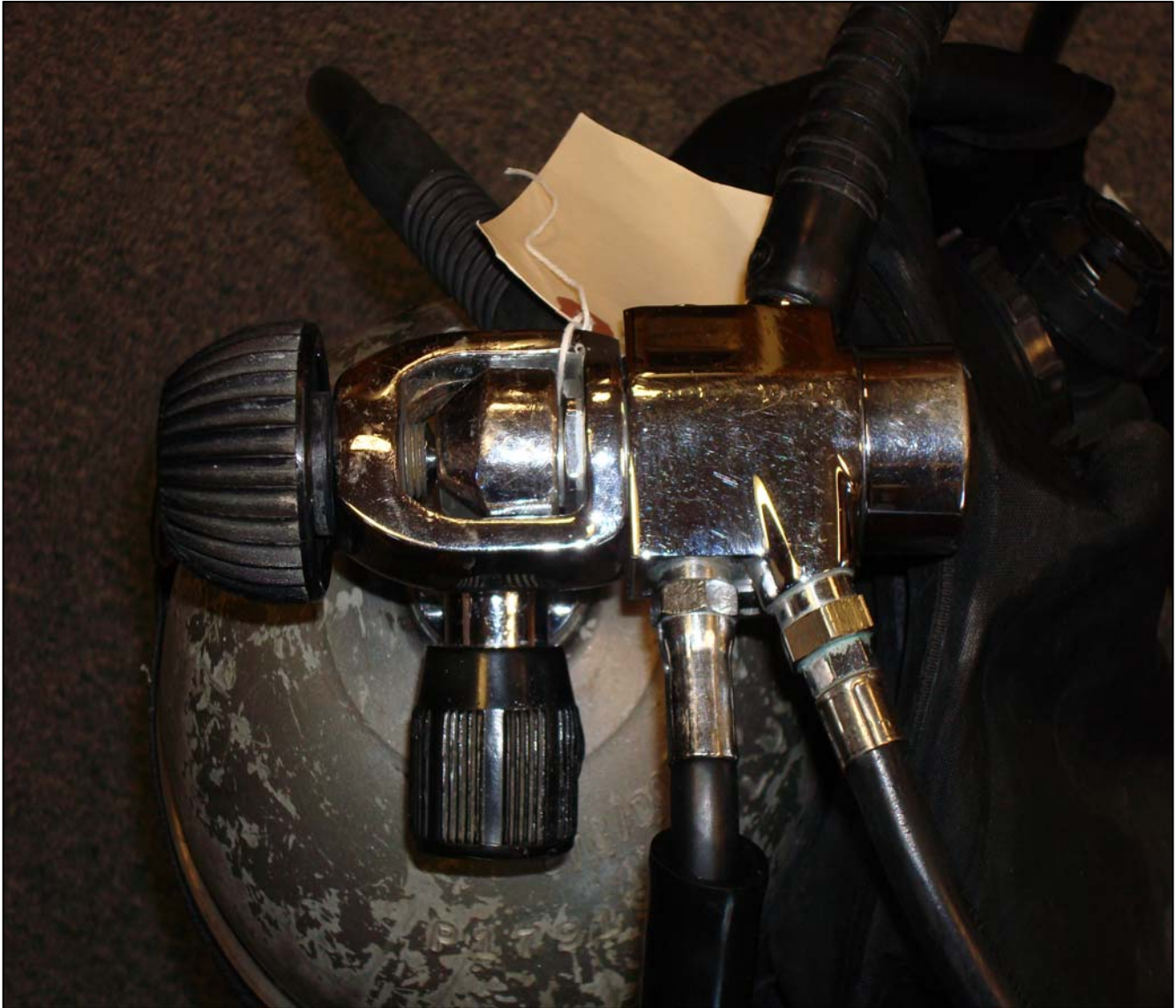
Photo 2. First-stage regulator attached at the cylinder valve incorrectly. The regulator block to the right of the valve should have been rotated 180 degrees so the second-stage hoses appearing at the top of this picture would have profiled at the bottom or the diver's right side.