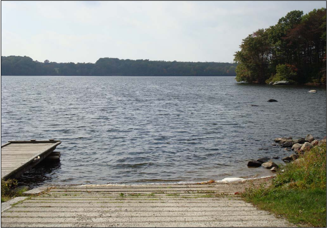
Photo 3. Boat ramp where rescue boats were launched and the location of the command post. The dive site is not visible due to distance and the land mass on the right side of the picture.